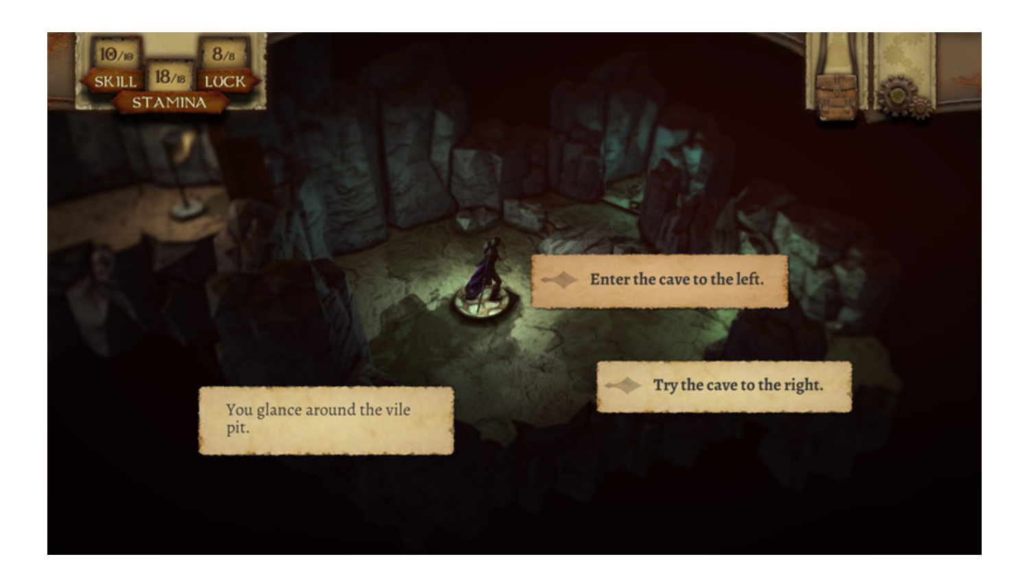
The Warlock Of Firetop Mountain Activation Code And Serial Key

Download >>> <a href="http://bit.ly/2SMPAER">http://bit.ly/2SMPAER</a>